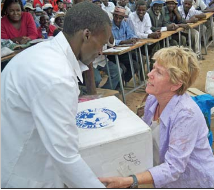
Community UMC in Crofton recently traveled on a VIM trip to Zimbabwe where they dedicated a solar power project, distributed items to improve the quality of life among the poor and built upon their relationship with churches there.

We found that the economy in Zimbabwe is in a total tailspin. With an annual inflation rate exceeding 20 million percent, there