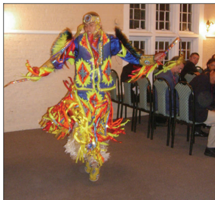
Traditional native American dance at Presidential Leadership Summit, Bacone College

Bacone College, located in Muskogee, Oklahoma, is a predominantly Native American liberal arts college of the American Baptist Church.