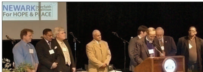
Left: Launch event with Muslim, Jewish and Christian religious leaders at Symphony Hall, downtown Newark.